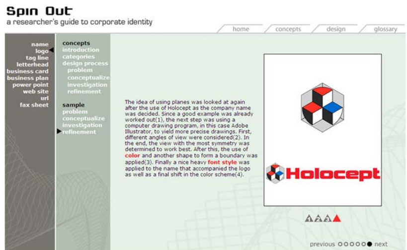
Figure 1. Spin Out: a researcher's guide to corporate identity http://innovation.swmed.edu/idguide .

Universities and other nonprofit research organizations generate thousands of new technologies and product ideas annually, and each year billions of dollars are spent to sponsor the research that produces these innovations. A survey published by the Association of University Technology Managers (AUTM) reported over $41 billion in sponsored research expenditures in 2004. During that