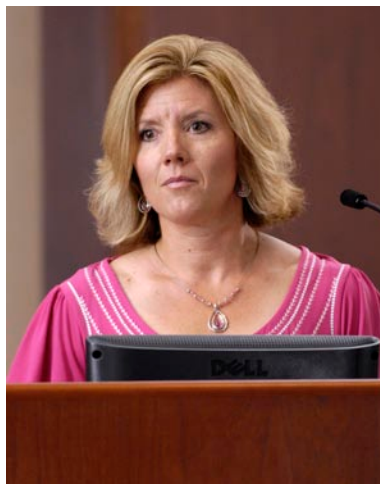
Figure 2. Photograph of the same speaker using the multiple strobe approach.

into the void, never to be seen again. It's flat looking and definitely looks anything but three-dimensional. A Better Approach But it's possible to avoid this black hole phenomenon. The approach came to me about 8-10 years ago, in part due to my frustration with the results and in part a belief that I could be doing this better. One evening I was scheduled to provide photographic coverage of an event that culminated in presentations to a small group of individuals. Instead of simply bringing my usual camera bag with a lone SB-28 flash, I brought along three additional heads, accompanied by Pocket Wizard transmitter/receivers. While the dinner was still in progress, I placed two strobes, one on either side of the podium and the remaining two at the back of the room. Each was set with the head adjusted straight up and the small built-in white card extended. The strobes were set to manual mode and in practically no time at all, I arrived at a usable exposure setting (Figure 2).