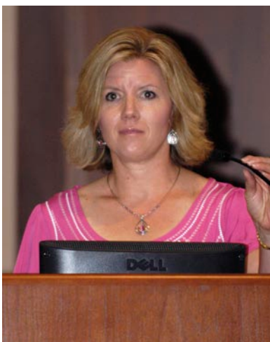
Figure 1. Example of using a single, camera-mounted flash to photograph speaker at the podium.

No, this isn't a supernatural occurrence nor is it a sci-fi illusion. It is real. It's what happens when the sensor-controlled output of the automatically set, on-camera TTL flash decides that enough light output has reached what you hope is your main subject. What may be in the foreground is mercilessly over-exposed and the area behind your subject is rendered dark and underexposed, a victim of the black hole. You can keep adding light in that direction, but inevitably all of this light is drawn